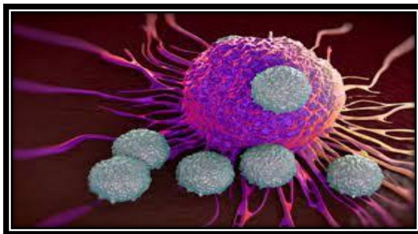
Figure 3. Schematic diagram for immunotoxicology [8] .